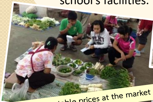
Surveying vegetable prices at the market