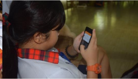
Letter writing in lieu of telephones

The school imparts students with life skills and occupational skills and encourages them to be innovative and to think outside the box. They are involved in many of the management aspects of the school through a Student Cabinet and student operating committees, starting with welcoming guests. Students are responsible for all purchases of the school, conduct audits and take charge of the selection of incoming students as well as the recruitment of new teachers. Older students are responsible for taking care of their younger brothers and sisters as well as the care and upkeep of the school's facilities.