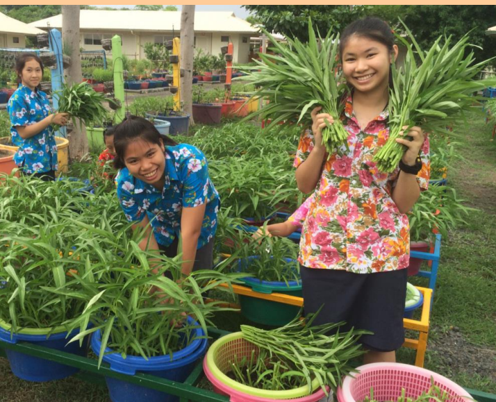
Vegetables grown in laundry baskets