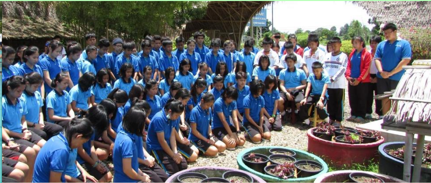
Bamboo School Students sending their good wishes to earthquake victims

School fees are jointly paid by the students and their parents in the form of community service and tree planting. Parents and students are required to share the responsibility of 800 hours of community service and the planting of 800 trees per year. By the time these students have completed their secondary education, they will have planted 4,800 trees and, together with their parents, experienced the joy of doing public good.