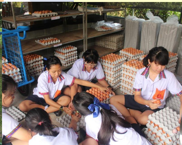
Students sorting 1,000 chicken eggs per day