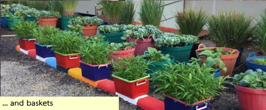
... and baskets