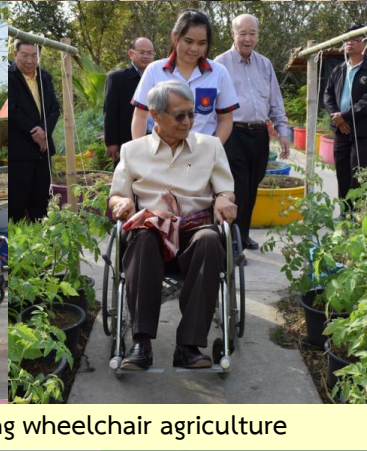
Deputy PM experiencing wheelchair agriculture