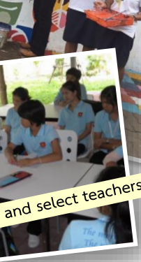
Students make trees and walkways colorful