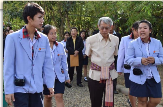
Students welcoming the Deputy Prime Minister

The school imparts students with life skills and occupational skills and encourages them to be innovative and to think outside the box. They are involved in many of the management aspects of the school through a Student Cabinet and student operating committees, starting with welcoming guests. Students are responsible for all purchases of the school, conduct audits and take charge of the selection of incoming students as well as the recruitment of new teachers. Older students are responsible for taking care of their younger brothers and sisters as well as the care and upkeep of the school's facilities.