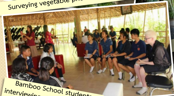
Bamboo School students interviewing student applicants