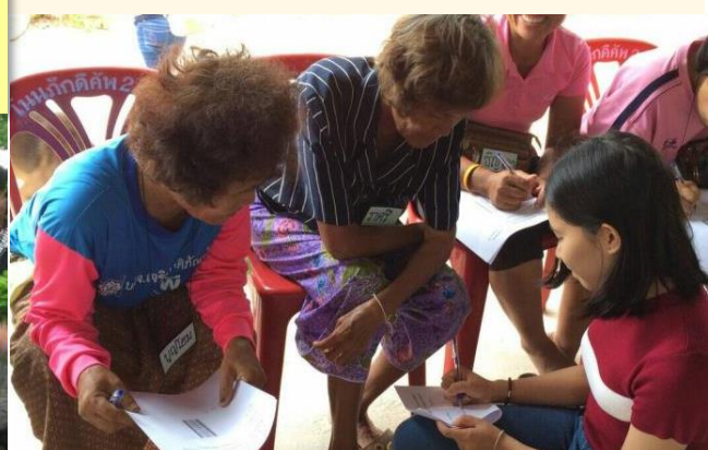
Health survey of elderly villagers