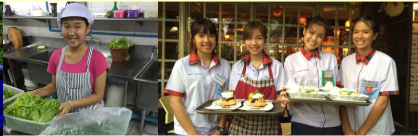
Summer job in restaurants

Classrooms and school facilities are made of Bamboo and include the world’s largest bamboo geodesic dome , based on the design of the world famous American architect, Buckminster Fuller.