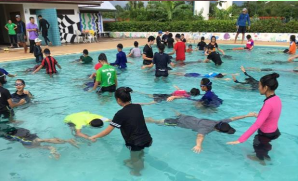
Training students from local schools in life saving swimming lessons

May WE bring LOVE where there is hatred HEALING where there is pain HARMONY where there is discord LIGHT where there is darkness HOPE where there is despair PEACE where there is strife May this world be a better place and let it begin with us