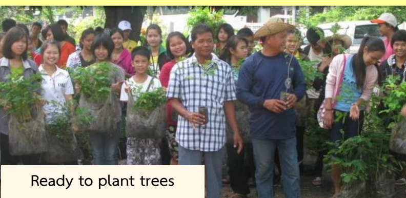
Ready to plant trees