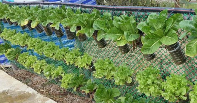
Vegetables in recycled bottles ...