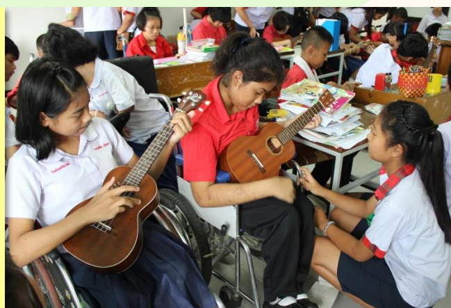
Teaching music to students with disabilities

School fees are jointly paid by the students and their parents in the form of community service and tree planting. Parents and students are required to share the responsibility of 800 hours of community service and the planting of 800 trees per year. By the time these students have completed their secondary education, they will have planted 4,800 trees and, together with their parents, experienced the joy of doing public good.