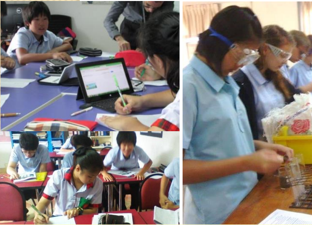
Bamboo School students spend one semester as “visiting students” in international schools

The learning atmosphere at the school comprises sessions inside and outside the classrooms as well as outside the school compound. To further their experience in life and occupational skills, students are given the opportunity to be trained and employed during holidays in companies, hotels, hospitals, universities and institutions caring for people with disabilities.