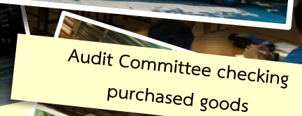
Audit Committee checking purchased goods