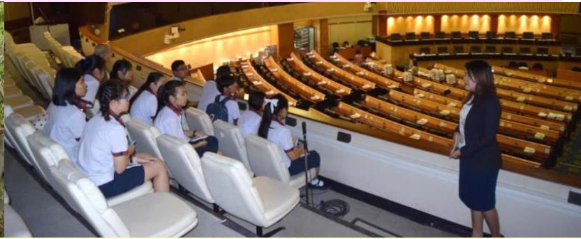
Learning outside of school – at parliament house