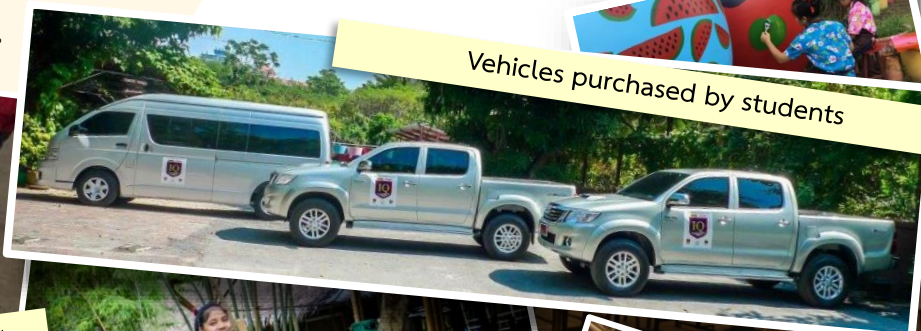
Vehicles purchased by students