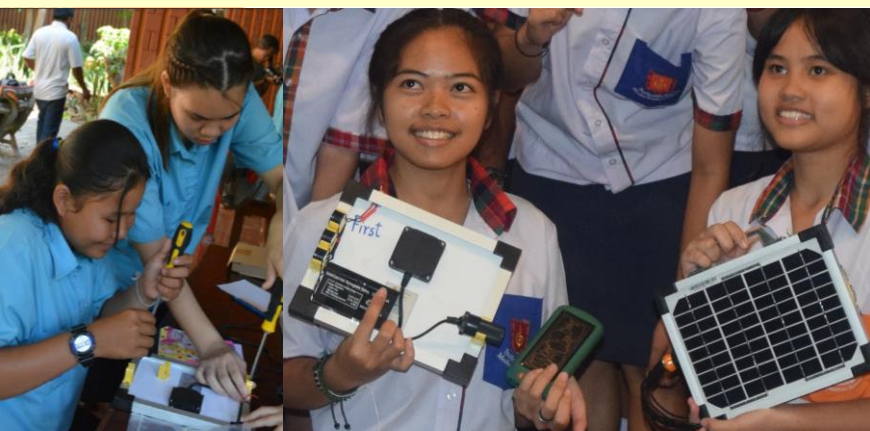
Solar torches made by students