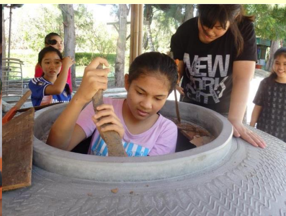
Female students making water jars