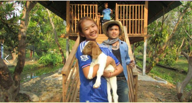
Learning outside the classroom – goat raising

The learning atmosphere at the school comprises sessions inside and outside the classrooms as well as outside the school compound. To further their experience in life and occupational skills, students are given the opportunity to be trained and employed during holidays in companies, hotels, hospitals, universities and institutions caring for people with disabilities.