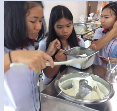
Student Ice-cream business

The types of income generating activities carried out by the students are varied. Student businesses range from vegetable growing to animal raising, food products, production of solar-powered torches and water pumps, water catchment jars, coffee mugs and the sales of goods and services. As a Lifelong Learning Center, the school also provides business training to villagers in surrounding communities, ranging from vegetables to out-of-season lime and food processing.